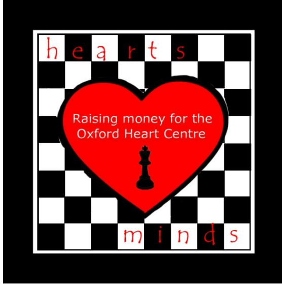
HEARTS AND MINDS CHESSATHON

I use my love of chess as the vehicle to do this and the Management at Castle Quay Shopping Centre were very generous in granting me the free use of a unit for the event.